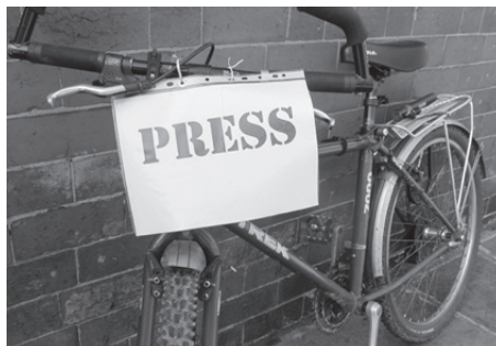
WHEELED OUT: Johnston Press reporters feel forced to turn to pedal power.

The NUJ suspected that the cut was delayed as JP did not have alternatives in place, adding: "The reduction in mileage rates will heavily impact on our members, particularly photographers, sports reporters and staff who have no longer have an office. It not only wipes out any minimal pay rises staff have received in recent years, but will also prevent them doing their jobs properly. (Union) reps have told us there are no pool