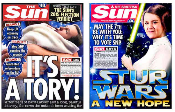
Facing both ways: the English (left) and Scottish Sun

A Sun editorial on April 24 attacked Labour as "sworn to use the law to dismantle News UK if it wins power", describing this as "sinister state censorship". Its Labour rival, the Mirror, despite