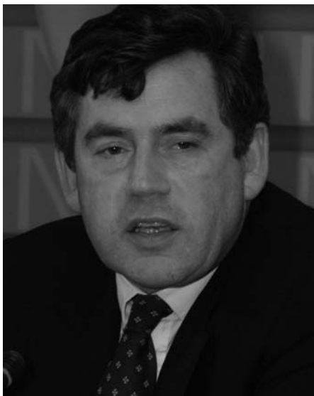
Brown: transparency is his best bet

Despite all the hype surrounding his installation as prime minister, he has failed to honour the undertakings which he gave that his Government would turn its back on spin. The more desperate the situation has become, the