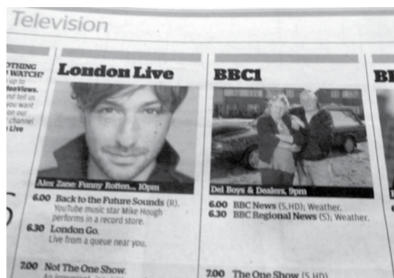
LISTING: Even getting greater prominence than BBC1 in the Evening Standard hasn't helped win audiences for London Live.

However, programmes and stations can lose audiences more quickly than they can be won – and while a hard-won following is more likely to remain loyal, the disillusioned seem far less likely ever to want