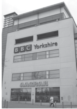
PERSUASIVE: BBC staff outside London valued the open-door approach of former director general Greg Dyke.