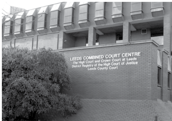
LEGAL NICETIES: The Crown Court in Leeds will be a focus for reporters when the case comes to trial later this year.

Those who deal daily with readers and audiences may well face local antagonism. That The Sun is remembered in Yorkshire for its coverage of the Hillsborough tragedy added another dimension to how